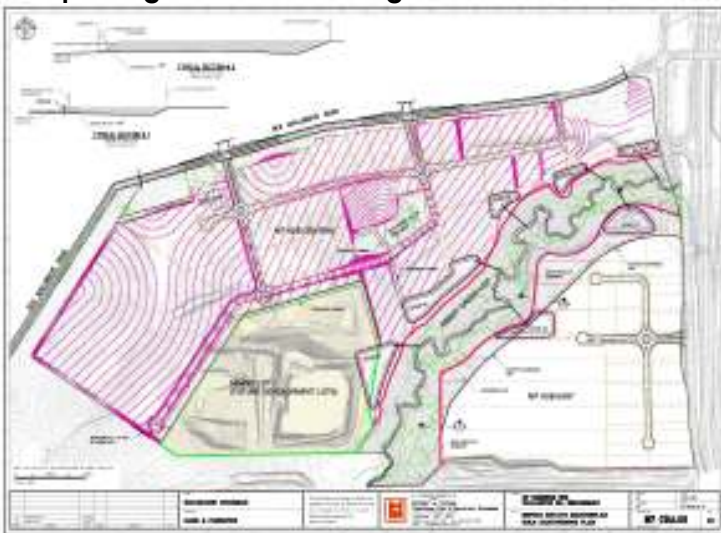
Above: Bulk Earthworks Plan Right: Site Plan/Road Layout