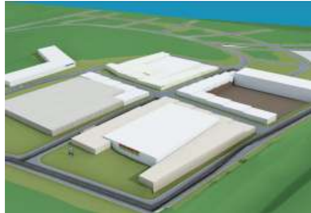
Below: Warnervale Town Centre